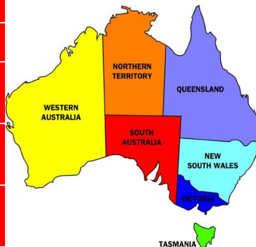
A map of Australia showing the states and territories.