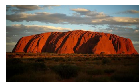
The Uluru rock is sacred to the local indigenous population